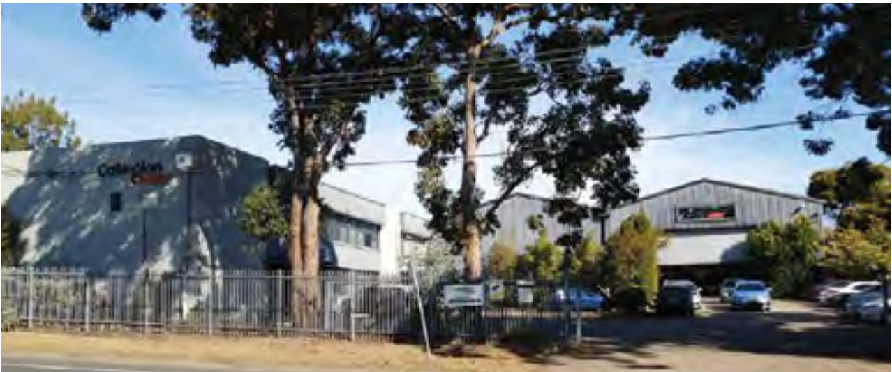
Global Head Office, Sydney, Australia